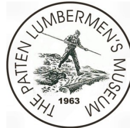
Patten Lumbermen's Museum Official Seal

Interested in becoming a Board of Director Member? Please ask us for information. A Board of Directors is most efficient and effective when new ideas and fresh enthusiasms are introduced. We welcome individuals committed to community service.